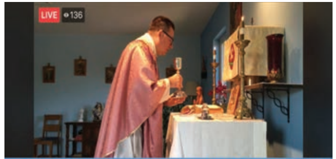
Join us each morning on Facebook as we live stream Daily Mass at 9am

For more information, contact the Par- ish Office at 856-228-4331