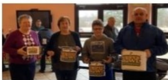
7:30am Mass Bright and early

Thanks to OLOH Youth Ministry families and friends who volunteered their time to be at the ready with pots and pans