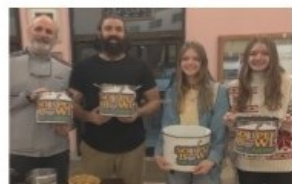
6:00pm Mass Closing out the day

2022 SOUPER BOWL OF CARING COLLECTION $1,692.76