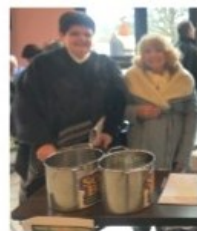
10:30am and 12:00pm Mass Old and new friends