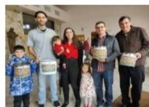
10:30 and 12:00pm Mass with a little help from new friends