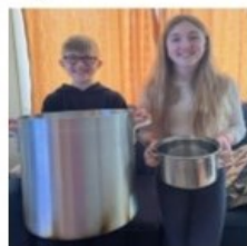
9:00am Mass Got a soup pot we could use for our collection? Missing a few helpers.