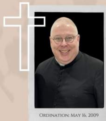
ORDINATION: MAY 16, 2009

RSVP please to help in reserving appropriate # of lanes for bowling